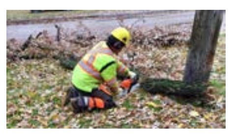
...and looking ahead, we predict that "can-do" AP will rebound.