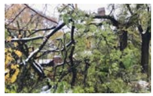
... but our trees were the worst hit.