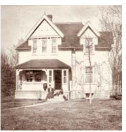
115 Middle Gate, early 1960s