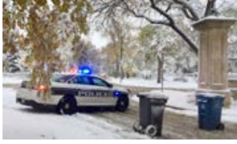
Some residents remained without power days after the storm.