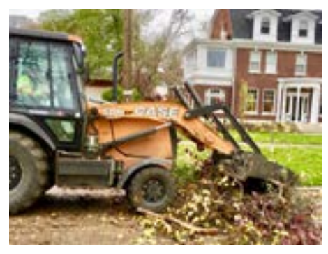
"One street at a time!"

Day Eleven: Hydro and City crews arrived.