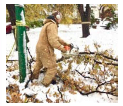
...and to take their own steps to prevent further damage.