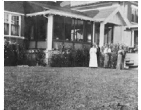
28 Middle Gate c. 1914

“We ‘put’ the veranda back on in 2012 with the help of a black and white photo that Pat, (our neighbourhood’s archivist) gave us! We literally handed that photo to Norm Remple and asked him to build it just like the picture” ...et voilà, true to the original, the veranda is restored and nestled into its new landscaping, making a beautiful complement to the streetscape.