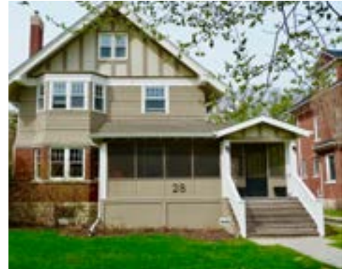
28 Middle Gate “After” - 2018