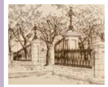
Armstrong’s Point THE HERITAGE REPORT

Now, with our goal of heritage designation realized, we can look back over those efforts and understand that without the people of Armstrong’s Point themselves, their sense of community, common purpose and spirit of volunteerism, our old-growth forest setting or historic structures alone would not have carried the day.