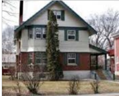
28 Middle Gate “Before” - 2004