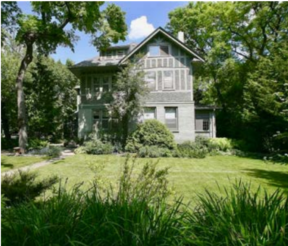
Theodore Alexander Hunt residence, 1909