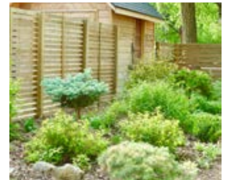
Sheri's Spring Garden

Point to Point: Armstrong's Point Community Newsletter. Send contributions, suggestions to: d.irwin@mymts.net