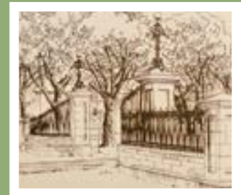
Armstrong's Point THE HERITAGE REPORT