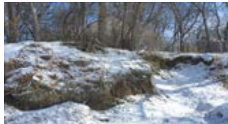
Riverbank erosion along West Gate.

http://www.winnipeg.ca/finance/findata/matmgt/documents//2017/1137-2017//1137-2017_Appendix_C_Hydraulic_Engineering_and_Assessment.pdf