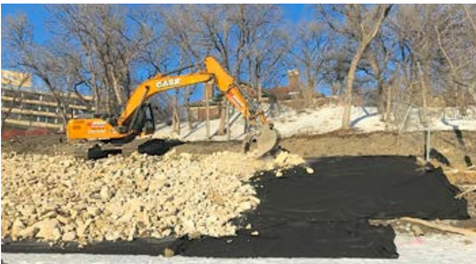
Riverbank stabilization work below the Cornish Library.