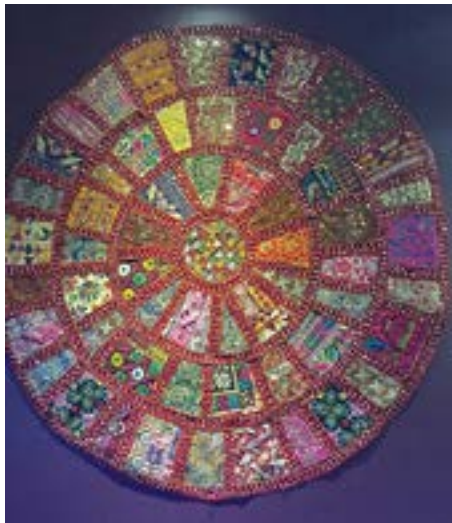
Medallion at Charisma Restaurant