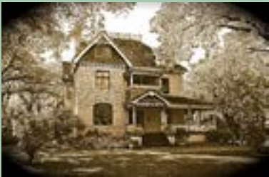
The Heritage Report: