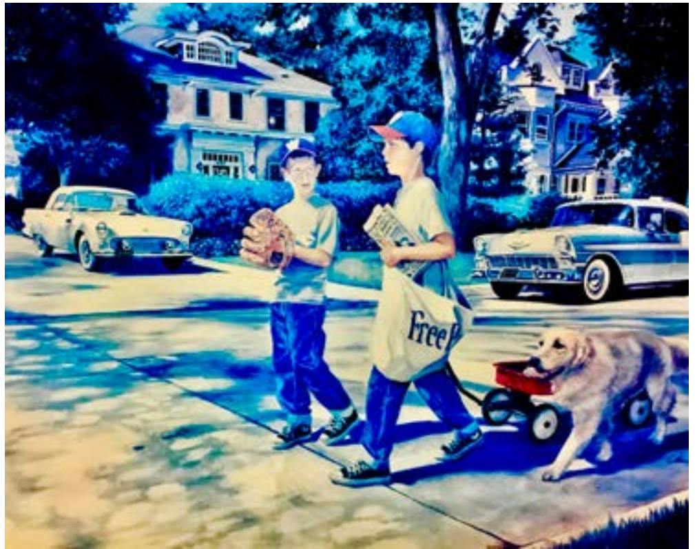
Illustration by Glenn Hayes