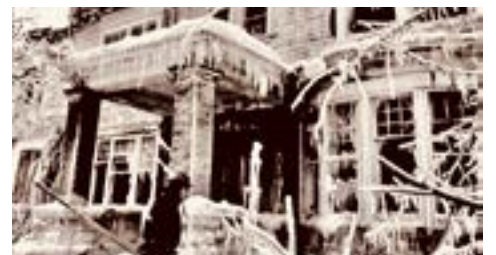
Sadly, the home pictured above, at the corner of 93 Middle Gate and Blanchard, was destroyed by fire.

If anyone has more to share on this theme of the automobile through time in AP, either photos or stories, we'd love to publish them.