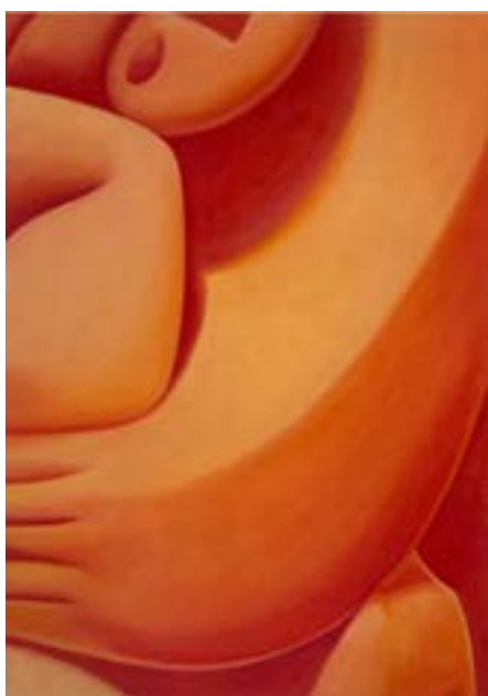
Wrap, 2021 24" x 29" Oil paint on unprimed canvas

Recent Works by Isabelle Perchaluk Warm and textural or cool and polished, volumes molded by light and shadow