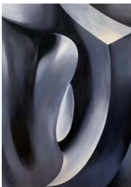
Steel, 2021 4.8 ft x 6.8 ft Oil paint and soft pastel on unprimed canvas