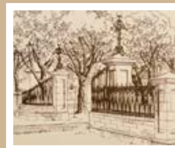
Armstrong's Point THE HERITAGE REPORT

President, Armstrong's Point Association