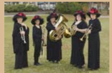
Classy Brass are Winnipeg's first and only women's brass quintet known for stirring favourites of yesteryear and trademark vintage Victorian hats.

Holland Street Organ Farmers' Market Lemonade Stand