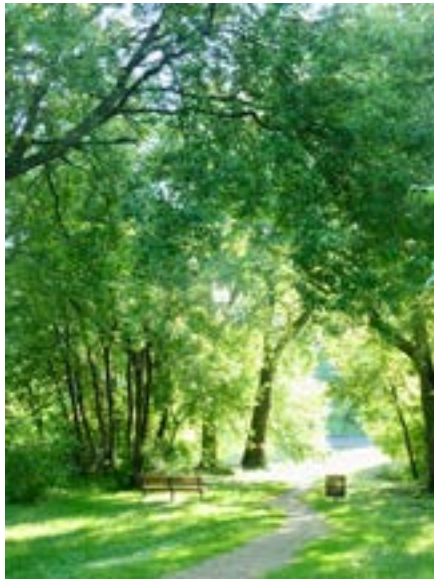
East Blanchard Park