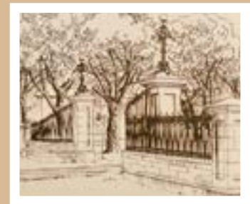
Armstrong's Point HERITAGE HOUSE TOUR

Well, it's time to once again share these wonderful old houses with the residents of Winnipeg!