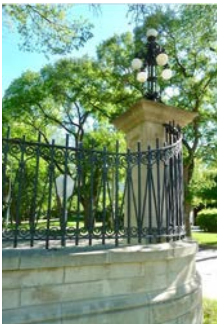
The larger pillars are set farther back than the smaller ones, creating a graceful curve in the limestone base and wrought iron.