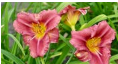
“Rosy Returns” daylilies will contrast nicely to the beige/grey colour of the gates

The Middle Gate entrance presented several challenges. There are differences from one side of the street to the other in height of the ground, dimensions of the gates, the placement of street trees and sidewalk orientation. Ian’s solution was to create a similar “feel” in terms of shape of the planting beds, “even though true symmetry would not be possible to achieve”.