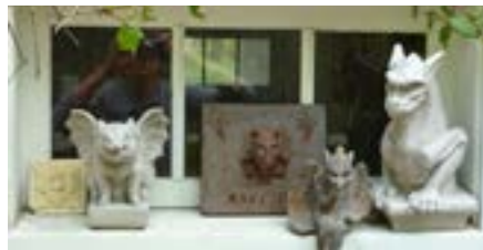
Grapevines and gargoyles