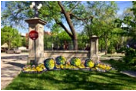
Designer’s rendering of the Middle Gate planting

One hundred and seventeen years later, APA’s Heritage Committee decided to complement the historic gates with landscaping. In consultation with the city’s Planning Department, a thoughtful design, befitting the importance of the gates, emerged.