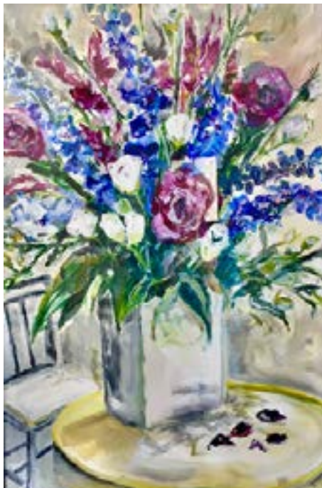
Purple & Blue Floral - acrylic on paper, 25" x 35"