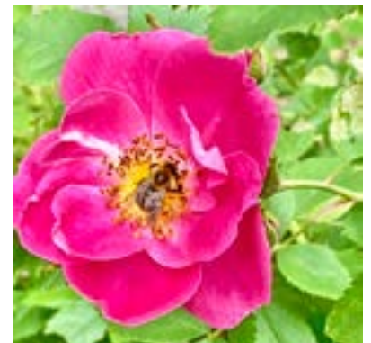
Bees in front yard

Point to Point: Armstrong's Point Community Newsletter Send contributions, suggestions to: d.irwin@mymts.net