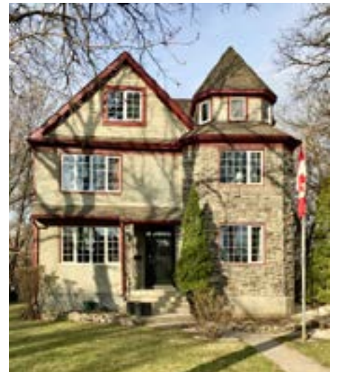
40 West Gate, today.